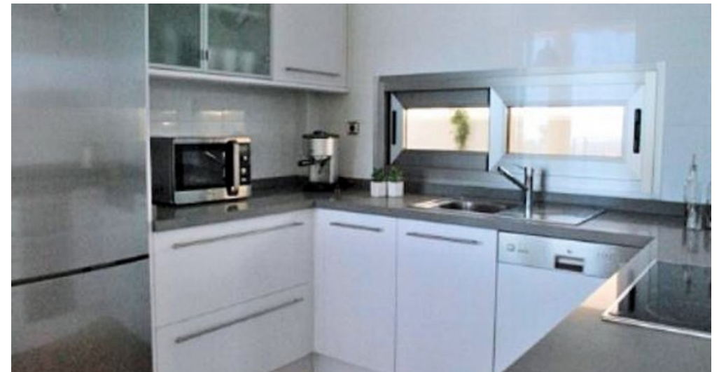
Benidorm Costa Blanca Villa mit Meerblick