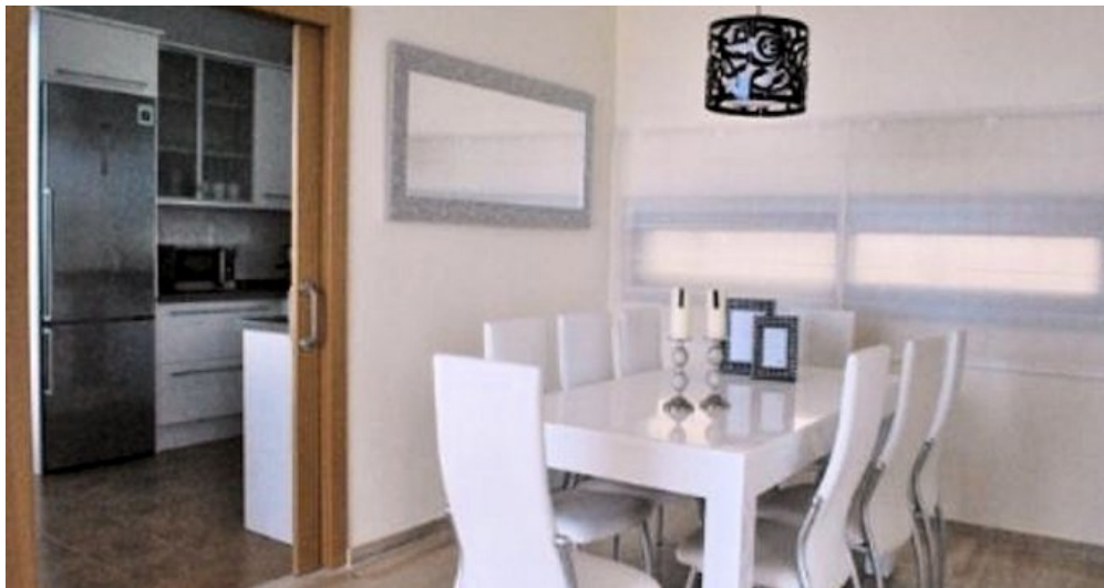
Benidorm Costa Blanca Villa mit Meerblick