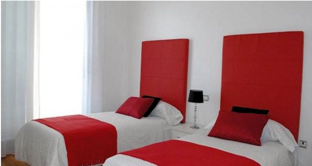
Benidorm Costa Blanca Villa mit Meerblick