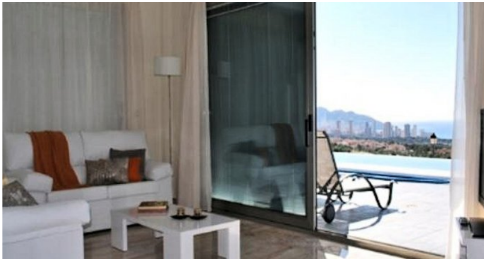
Benidorm Costa Blanca Villa mit Meerblick