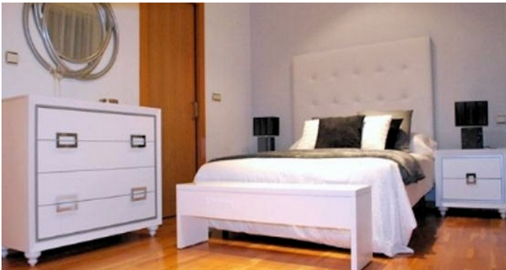
Benidorm Costa Blanca Villa mit Meerblick