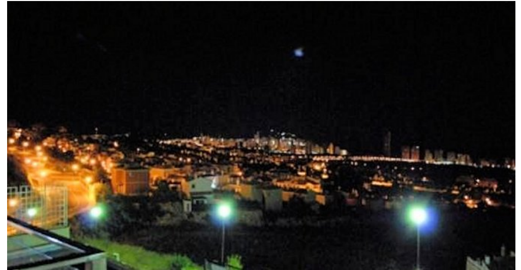
Benidorm Costa Blanca Villa mit Meerblick