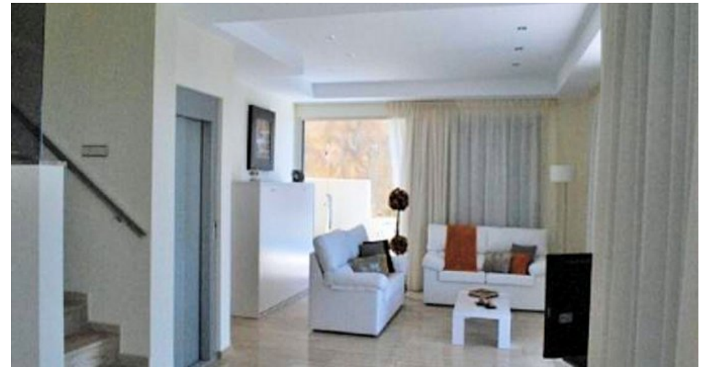
Benidorm Costa Blanca Villa mit Meerblick