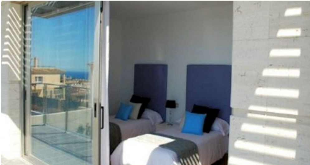
Benidorm Costa Blanca Villa mit Meerblick