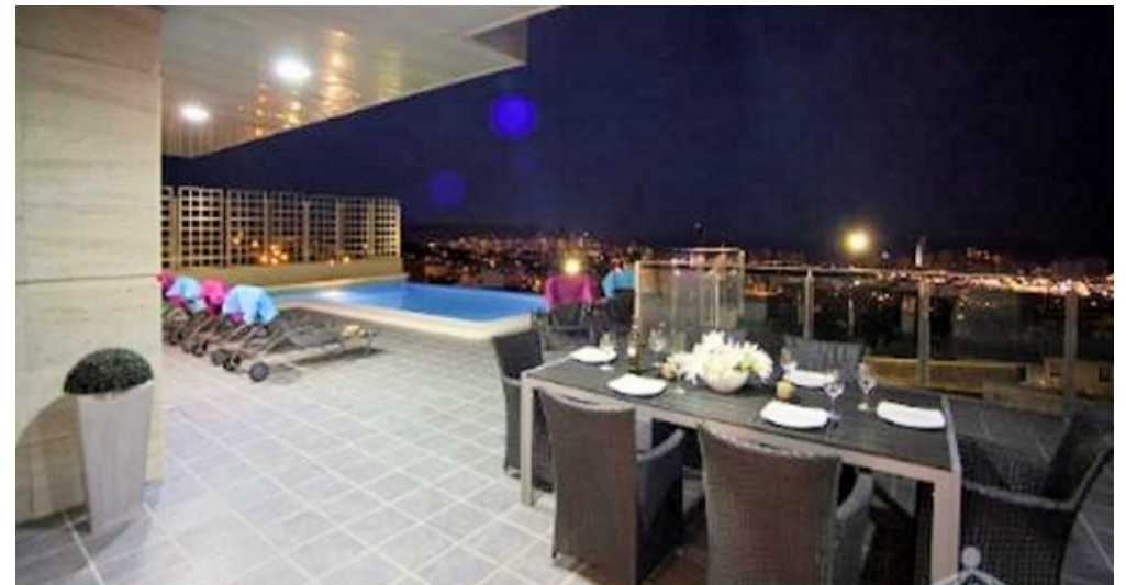
Benidorm Costa Blanca Villa mit Meerblick