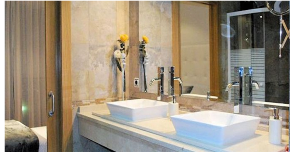
Benidorm Costa Blanca Villa mit Meerblick