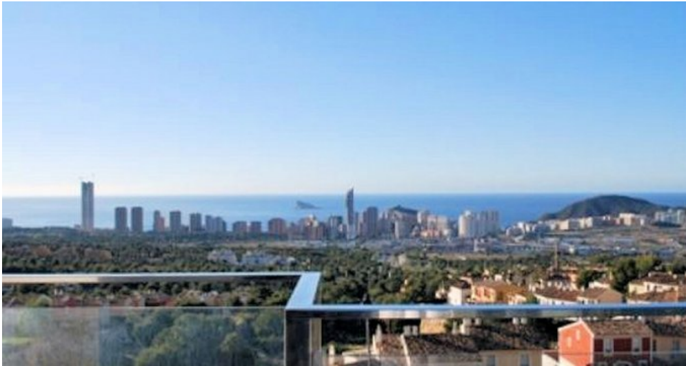
Benidorm Costa Blanca Villa mit Meerblick