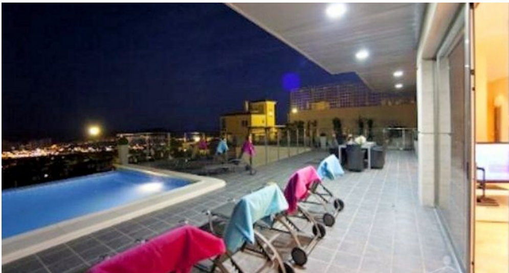
Benidorm Costa Blanca Villa mit Meerblick