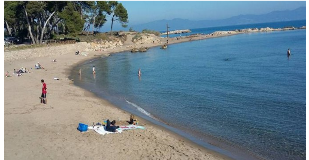
Spanien l'Escaló an der Costa Brava