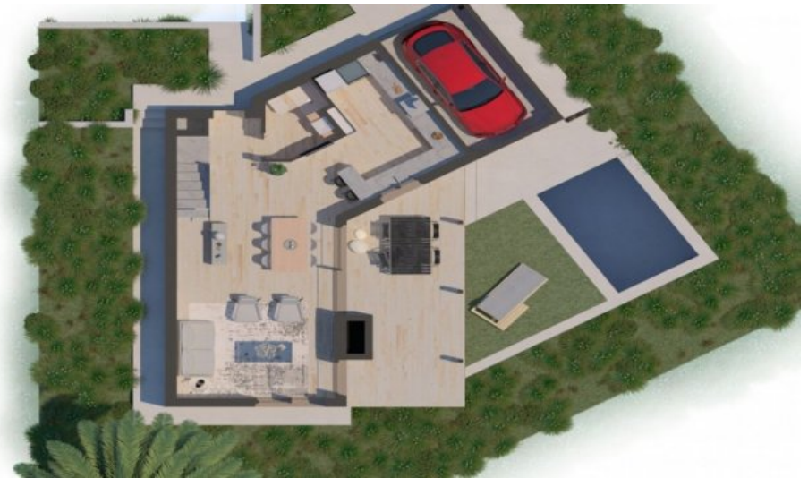
Neubau Fereinhaus in l'Escala an der Costa Brava