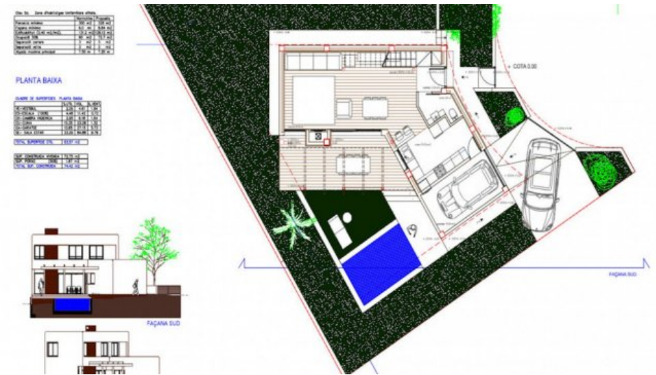
Neubau Fereinhaus in l'Escala an der Costa Brava