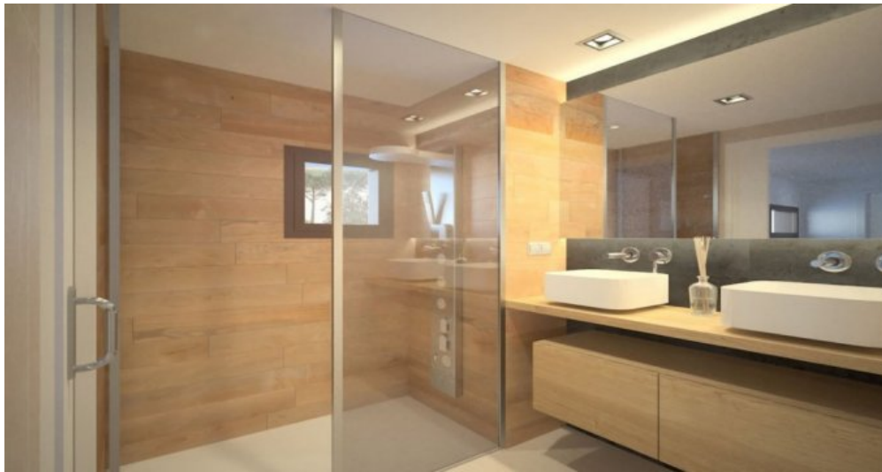
Neubau Fereinhaus in l'Escala an der Costa Brava