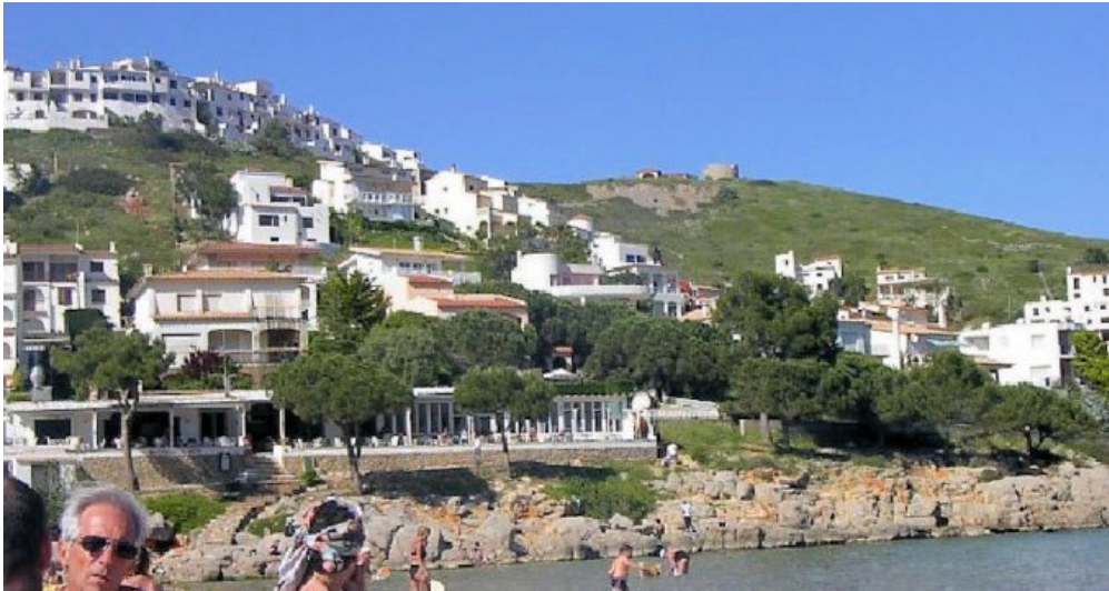
Spanien l'Escaló an der Costa Brava