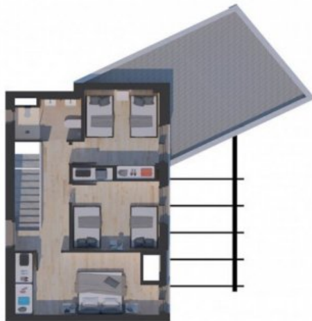
Neubau Fereinhaus in l'Escala an der Costa Brava