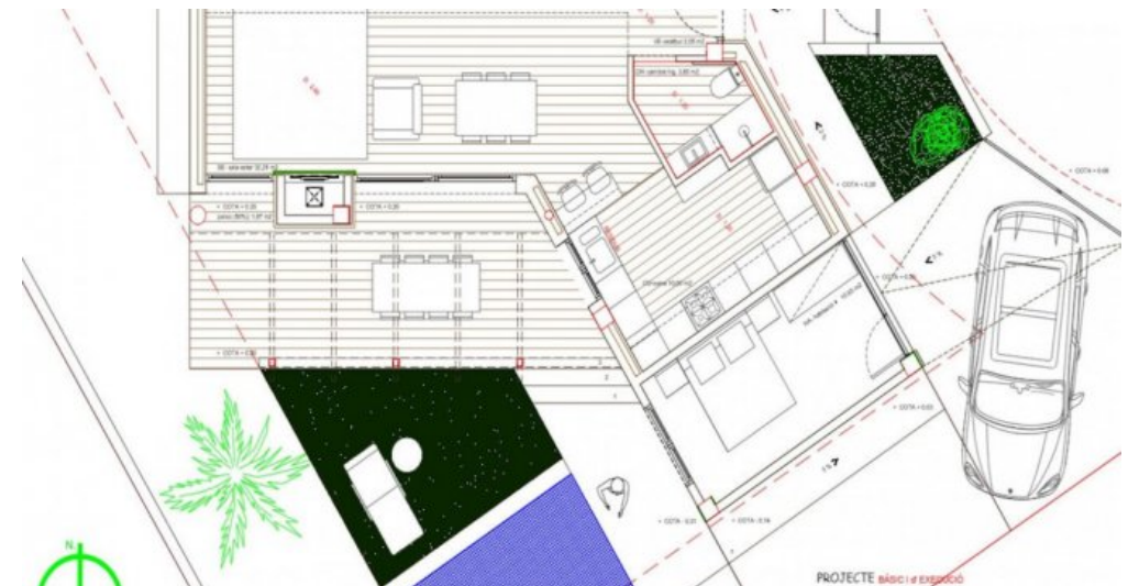
Neubau Fereinhaus in l'Escala an der Costa Brava