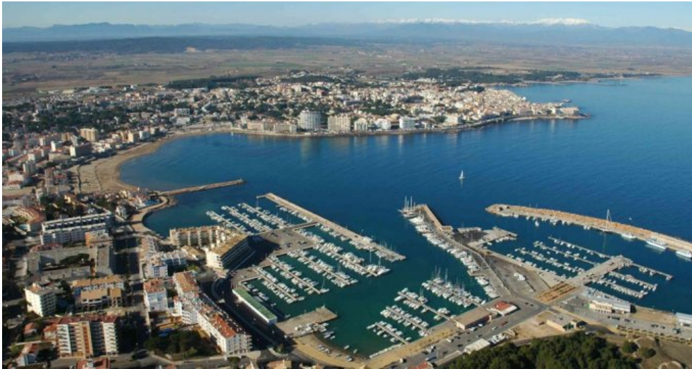
Spanien l'Escalade an der Costa Brava