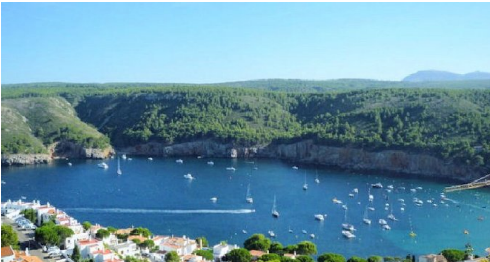
Spanien l'Escalade an der Costa Brava