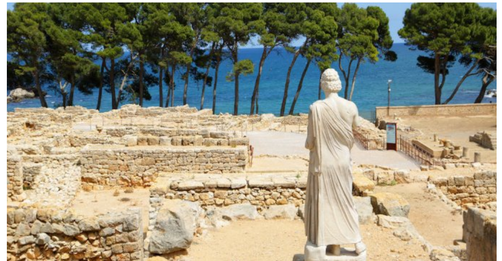
Spanien l'Escalade an der Costa Brava