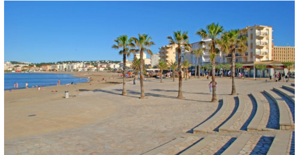
Spanien l'Escalade an der Costa Brava