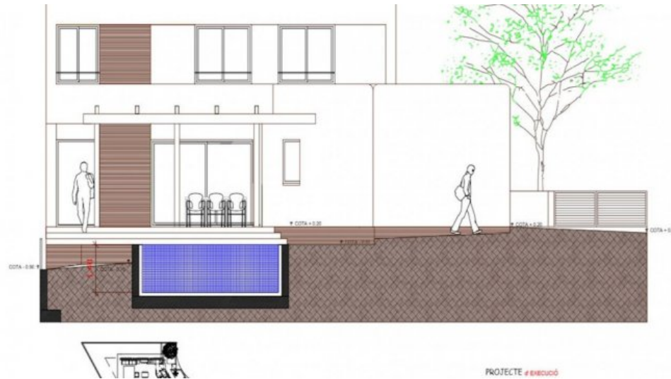
Neubau Fereinhaus in l'Escala an der Costa Brava