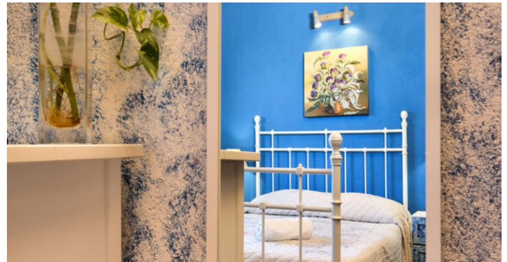
Ferienhaus Lloret Blau an der Costa Brava