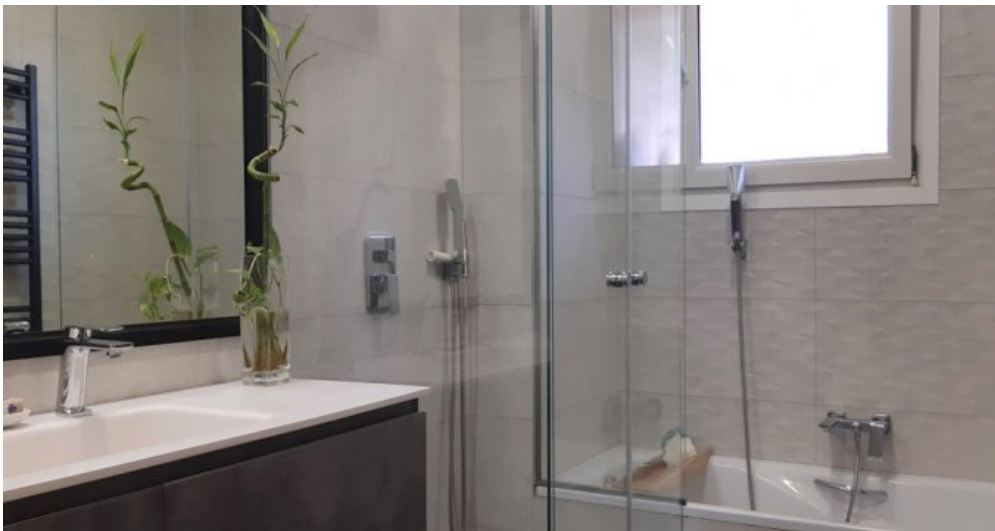
Ferienhaus Lloret Blau an der Costa Brava