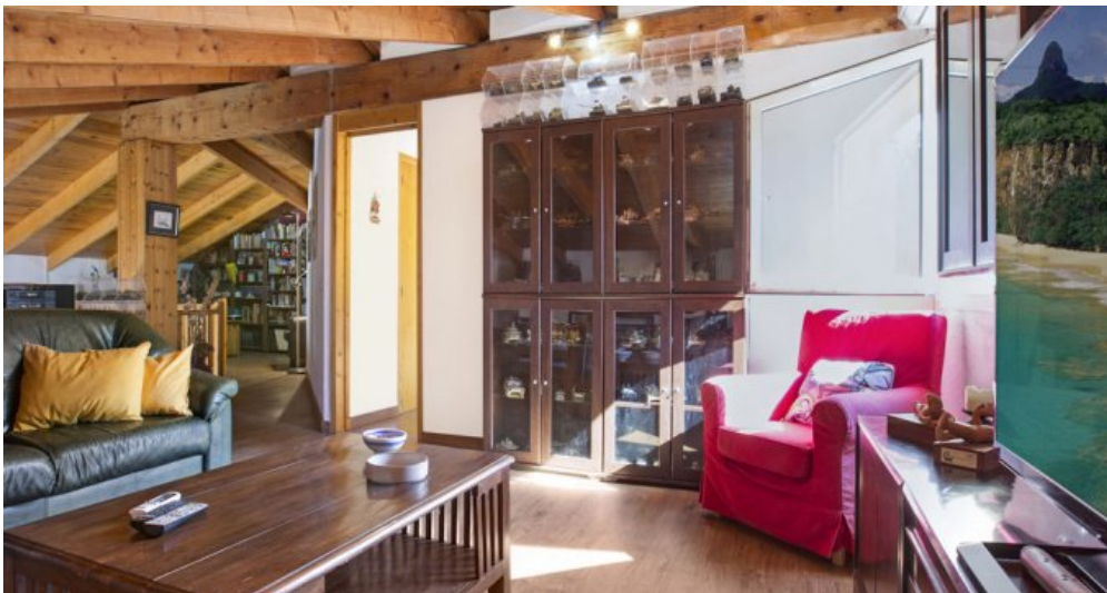
Ferienhaus Lloret Blau an der Costa Brava