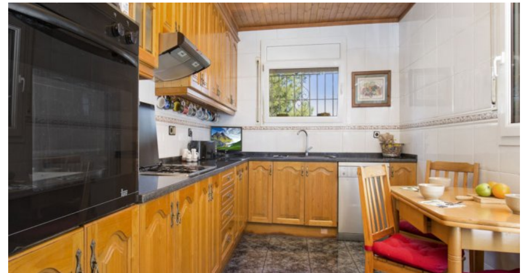
Ferienhaus Lloret Blau an der Costa Brava