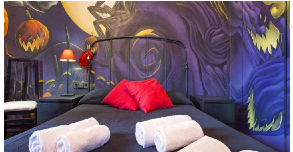
Ferienhaus Lloret Blau an der Costa Brava