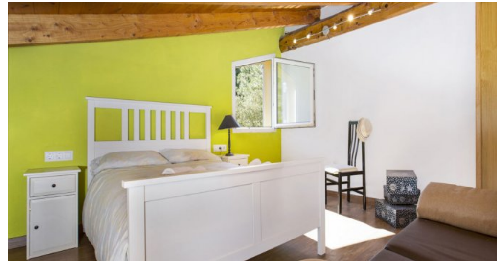
Ferienhaus Lloret Blau an der Costa Brava