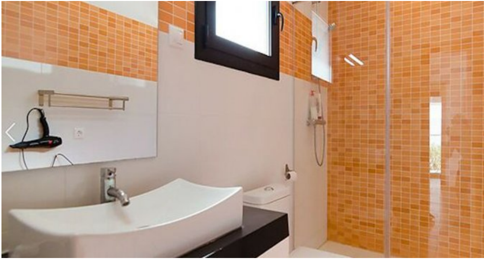
Spanien Ferienhaus Cala Canyelles Costa Brava