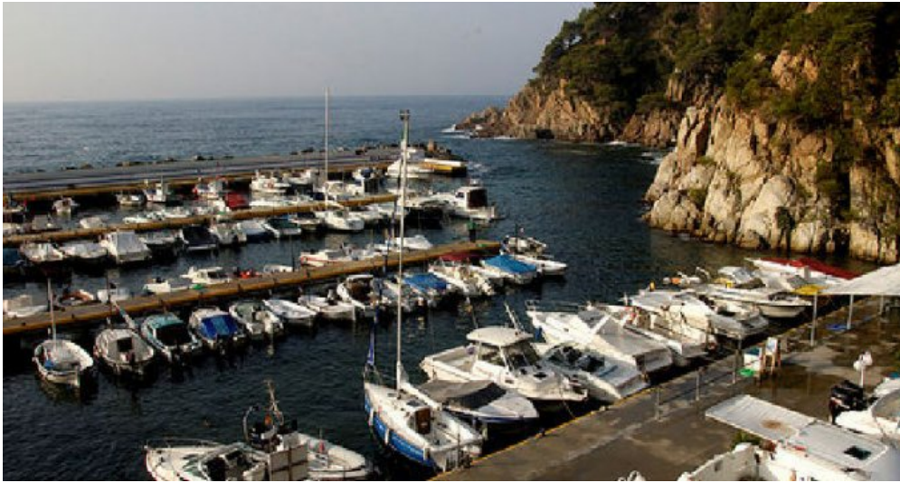
Spanien Ferienhaus Cala Canyelles Costa Brava