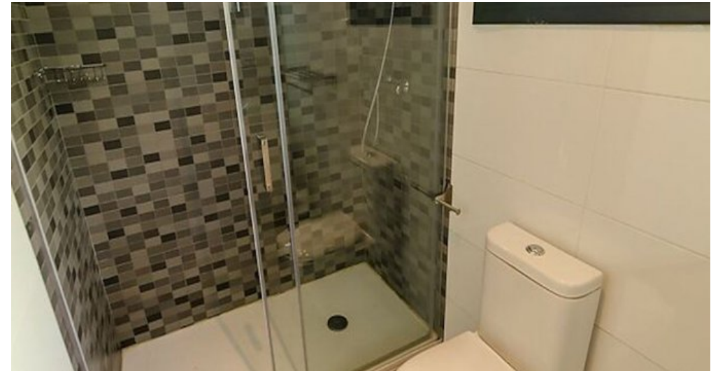
Spanien Ferienhaus Cala Canyelles Costa Brava