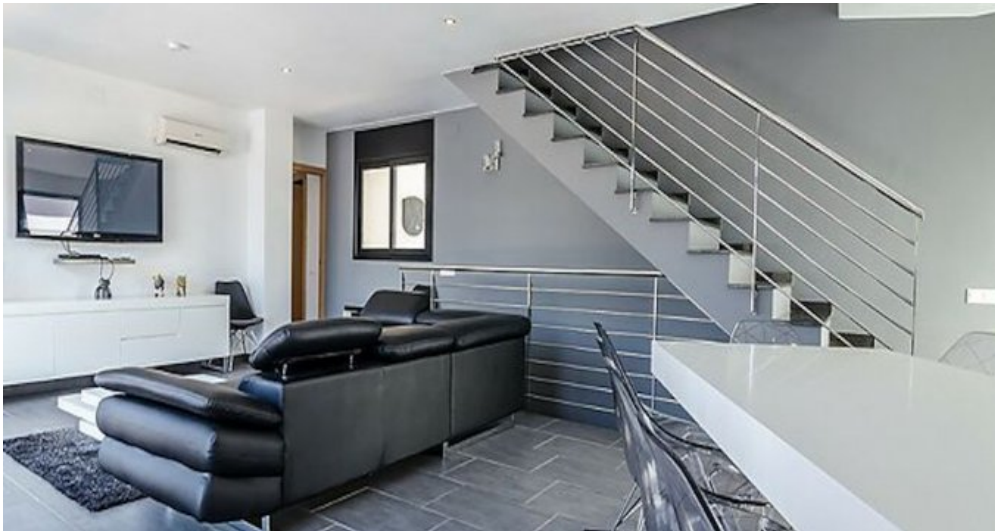
Spanien Ferienhaus Cala Canyelles Costa Brava