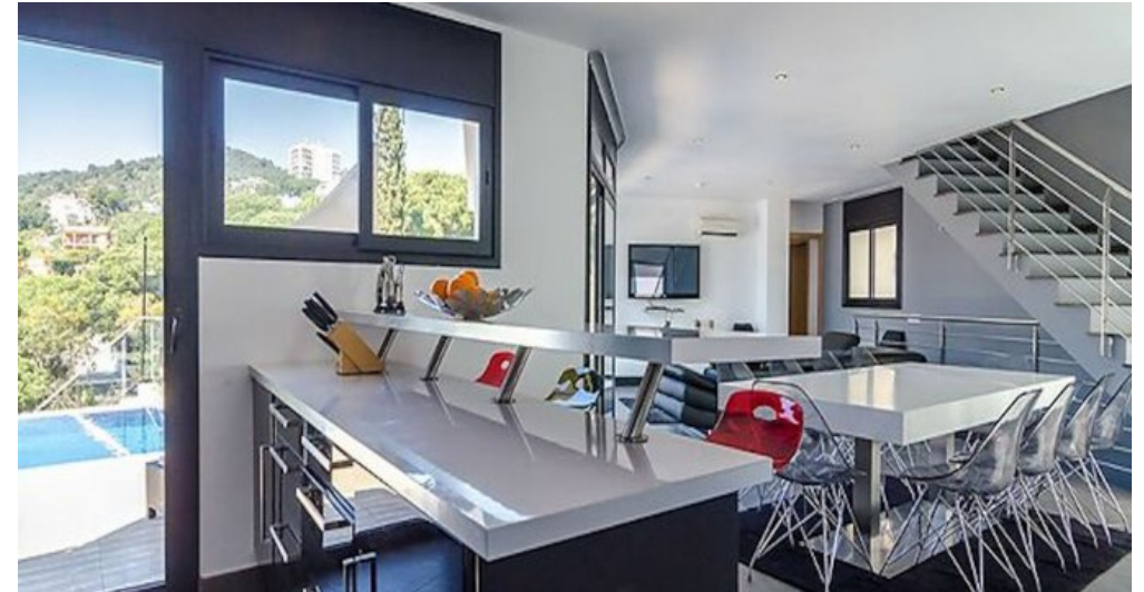
Spanien Ferienhaus Cala Canyelles Costa Brava