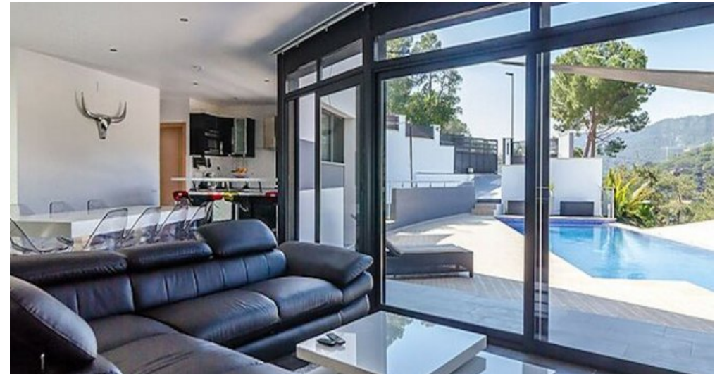
Spanien Ferienhaus Cala Canyelles Costa Brava