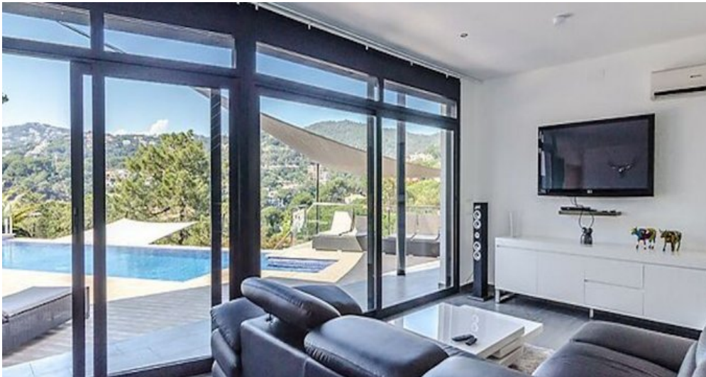
Spanien Ferienhaus Cala Canyelles Costa Brava