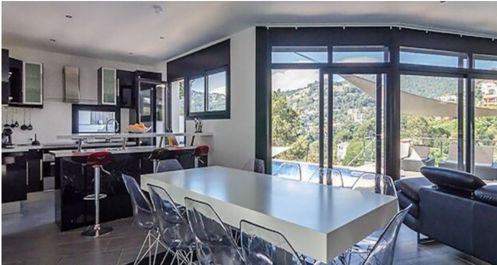
Spanien Ferienhaus Cala Canyelles Costa Brava