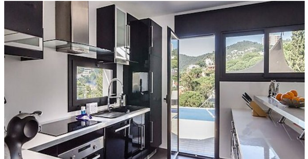
Spanien Ferienhaus Cala Canyelles Costa Brava