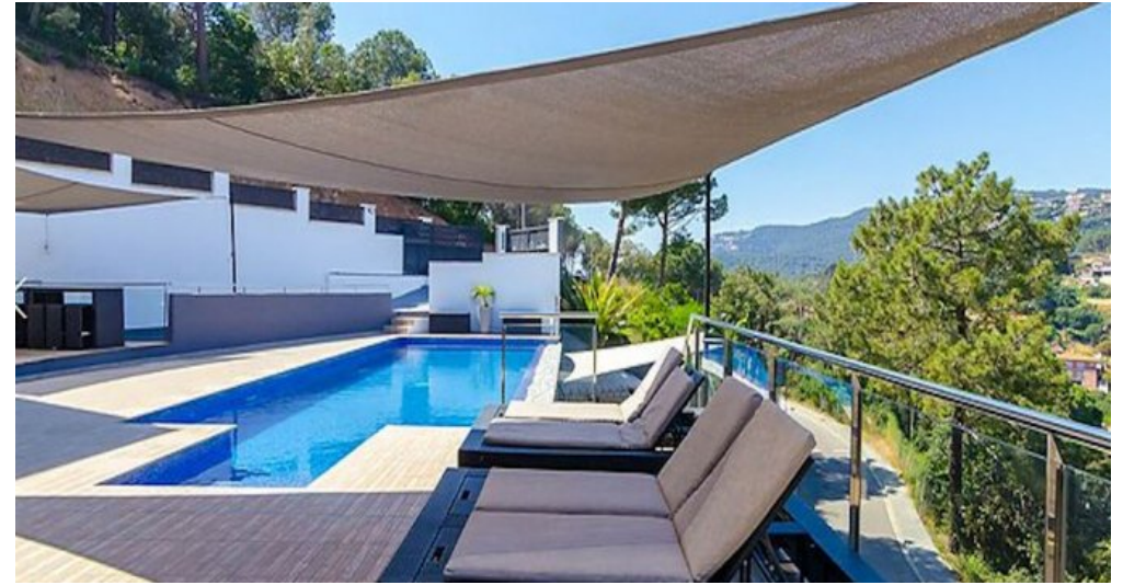
Spanien Ferienhaus Cala Canyelles Costa Brava