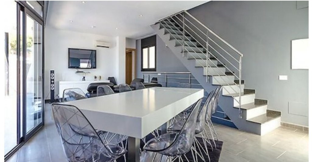
Spanien Ferienhaus Cala Canyelles Costa Brava