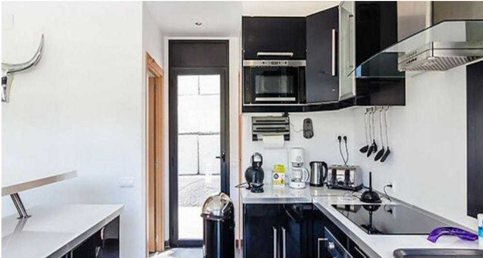
Spanien Ferienhaus Cala Canyelles Costa Brava