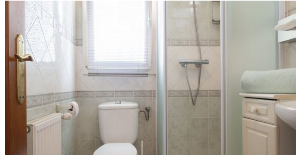
Spanien Fereinhaus in Südlage an der Costa Brava