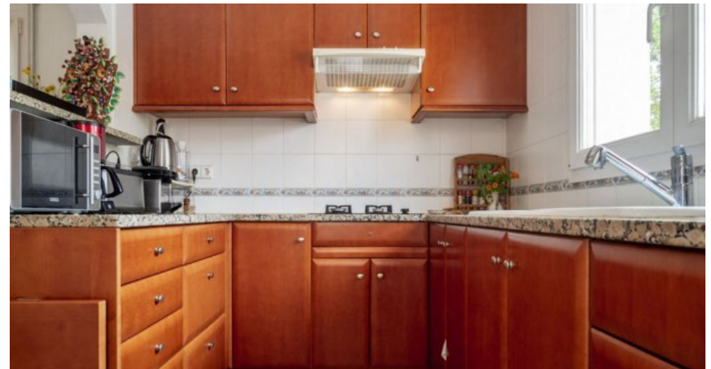
Spanien Fereinhaus in Südlage an der Costa Brava