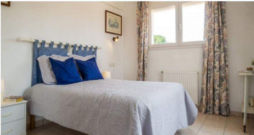
Spanien Fereinhaus in Südlage an der Costa Brava