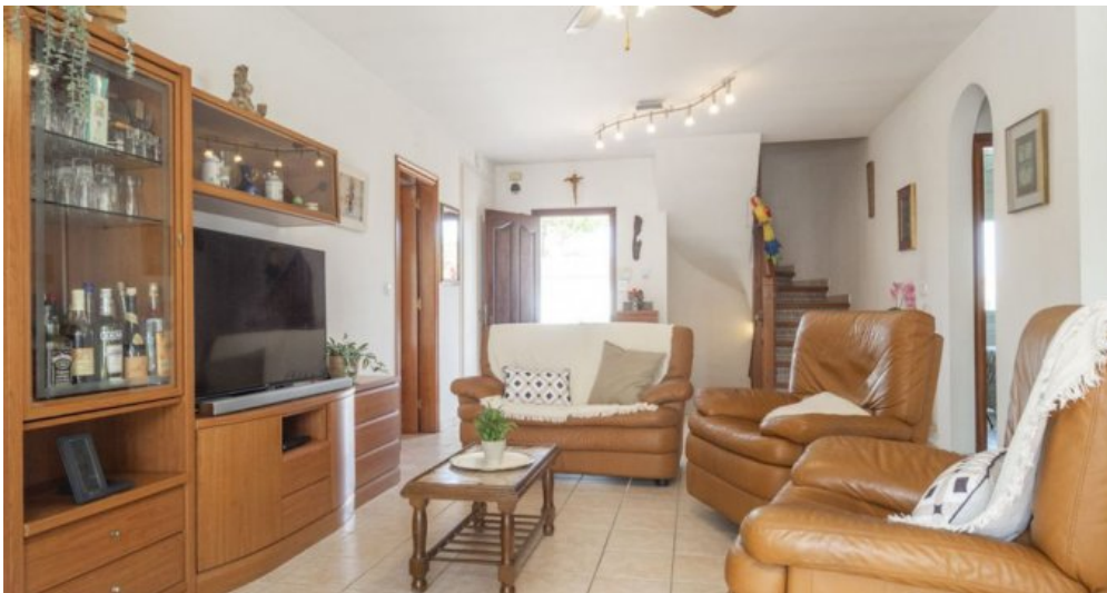
Spanien Fereinhaus in Südlage an der Costa Brava