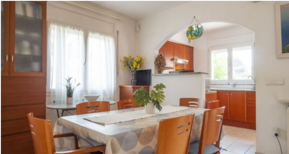
Spanien Fereinhaus in Südlage an der Costa Brava