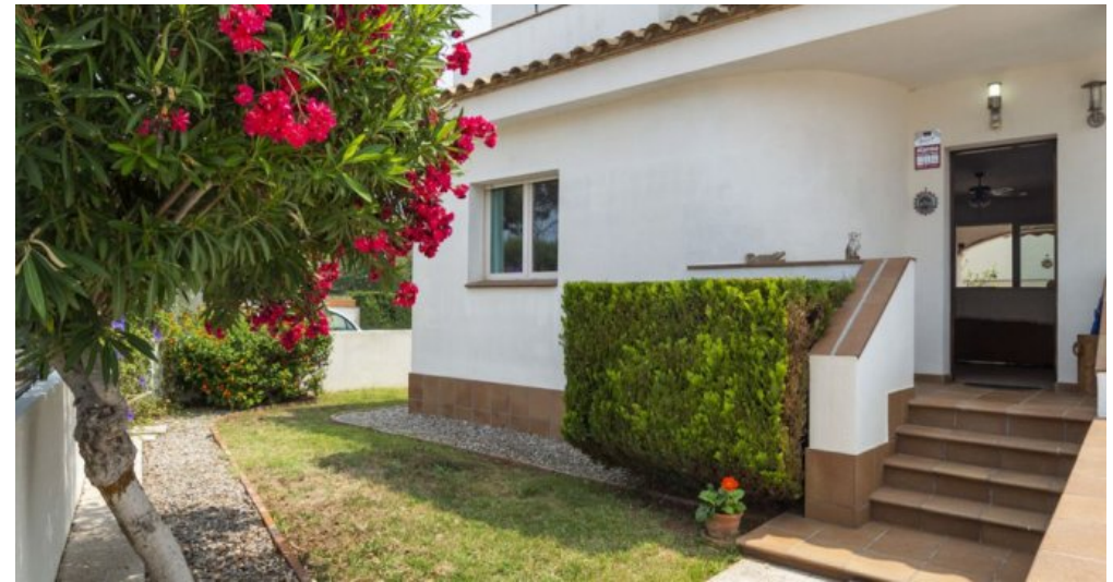
Spanien Fereinhaus in Südlage an der Costa Brava