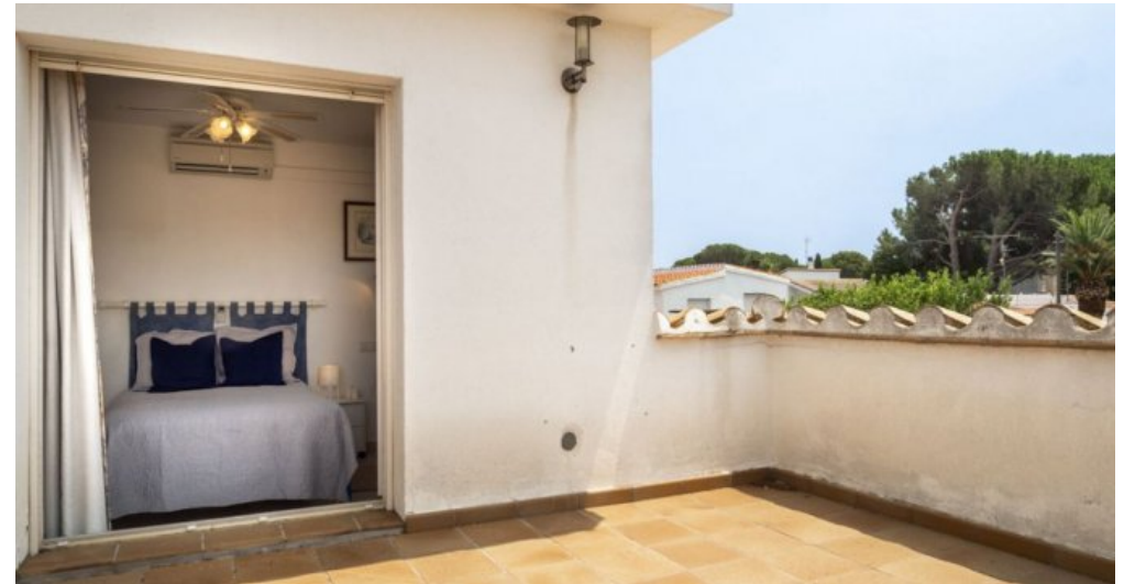
Spanien Fereinhaus in Südlage an der Costa Brava