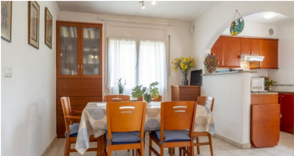
Spanien Fereinhaus in Südlage an der Costa Brava