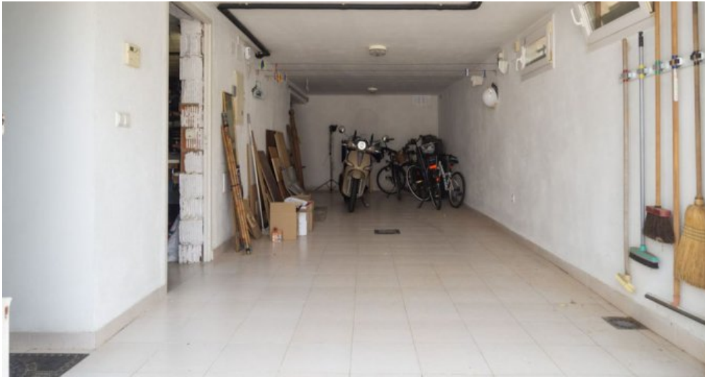
Spanien Fereinhaus in Südlage an der Costa Brava