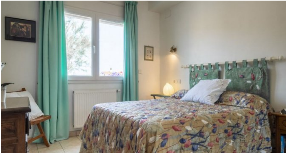
Spanien Fereinhaus in Südlage an der Costa Brava