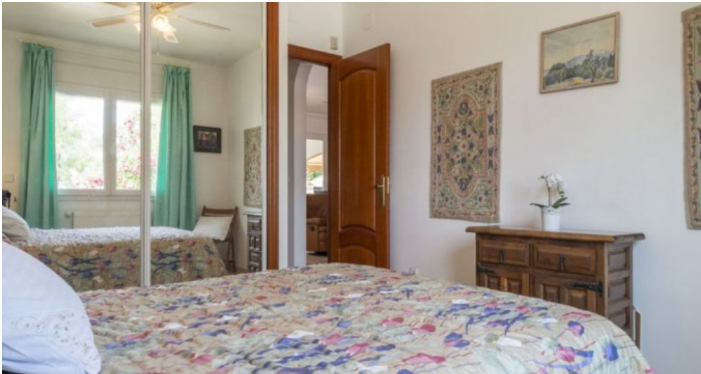
Spanien Fereinhaus in Südlage an der Costa Brava