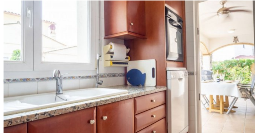
Spanien Fereinhaus in Südlage an der Costa Brava