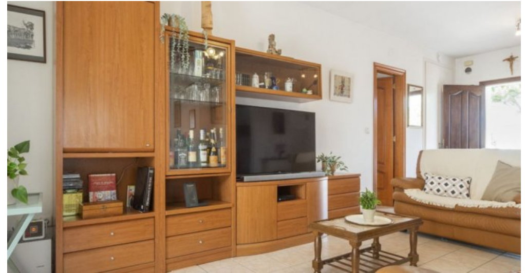
Spanien Fereinhaus in Südlage an der Costa Brava