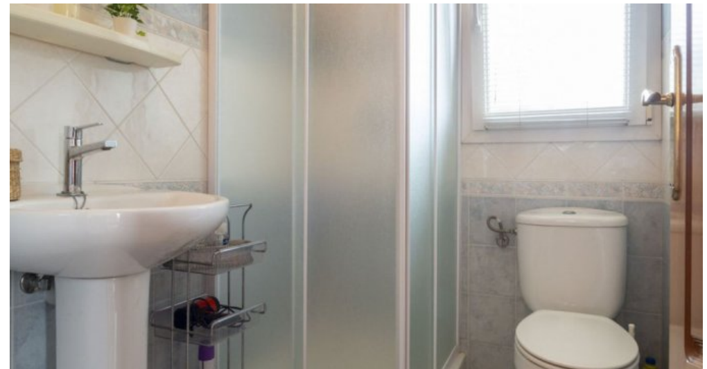
Spanien Fereinhaus in Südlage an der Costa Brava