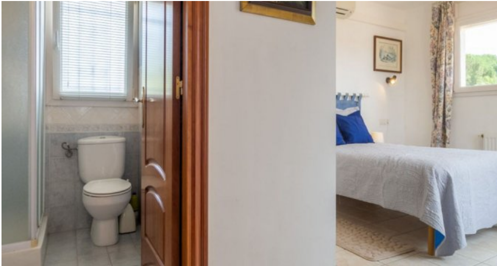
Spanien Fereinhaus in Südlage an der Costa Brava