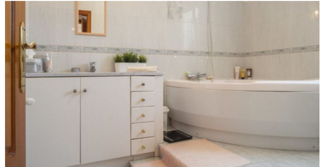
Spanien Fereinhaus in Südlage an der Costa Brava