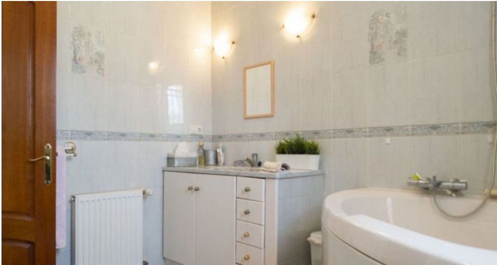
Spanien Fereinhaus in Südlage an der Costa Brava