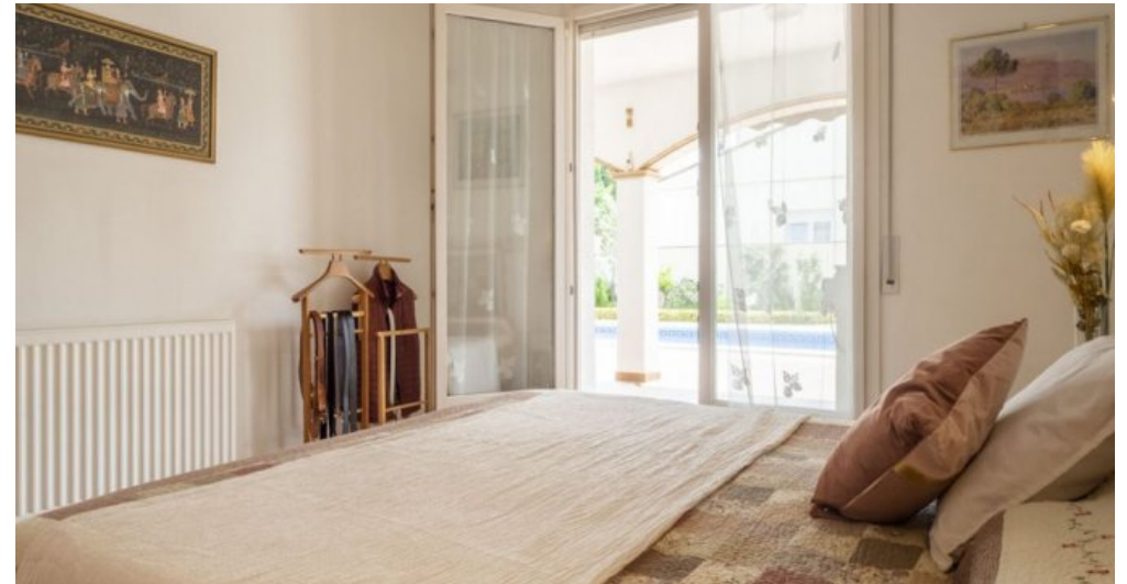
Spanien Fereinhaus in Südlage an der Costa Brava