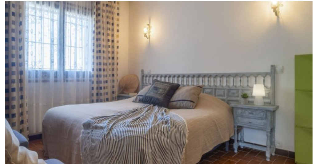
Ferienhaus Escala privater Pool