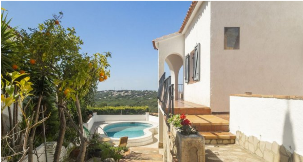
Ferienhaus Escala privater Pool