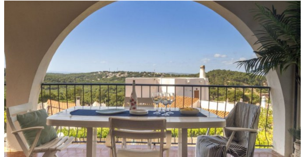
Ferienhaus Escala privater Pool