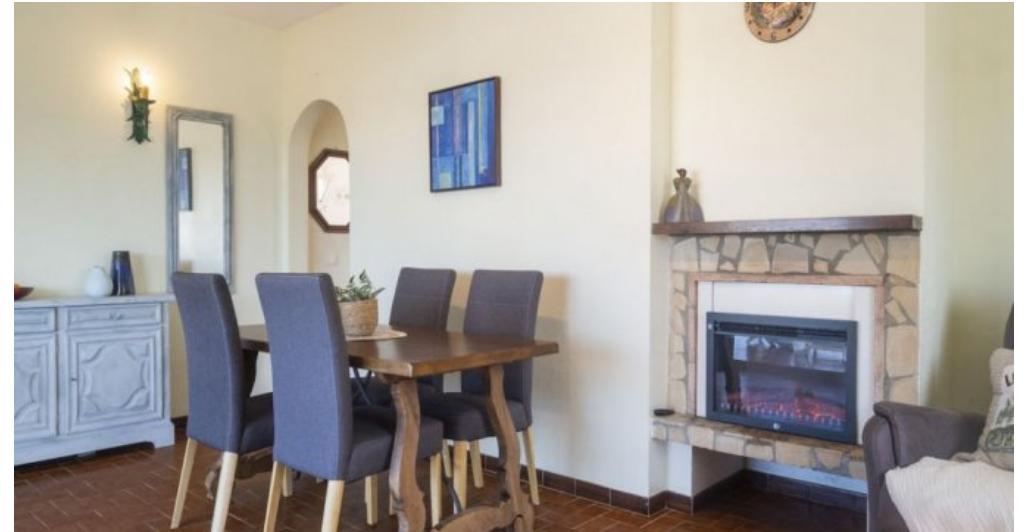
Ferienhaus Escala privater Pool