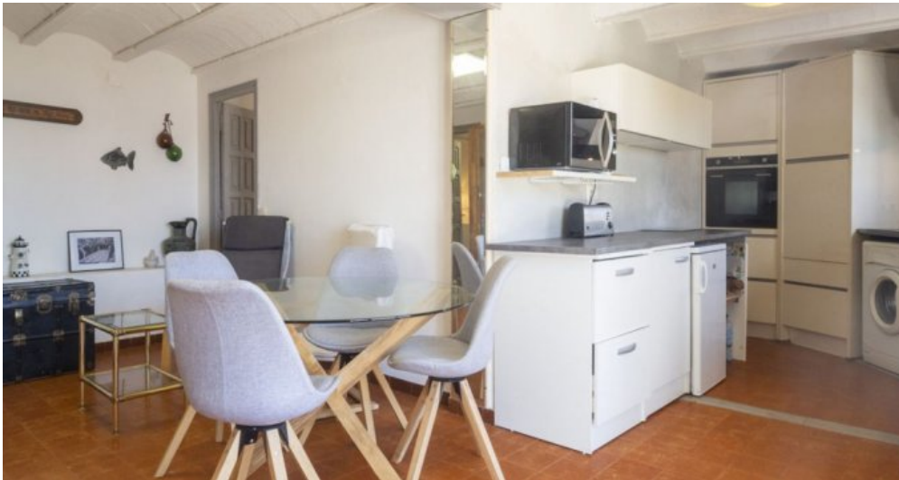
Ferienhaus Escala privater Pool