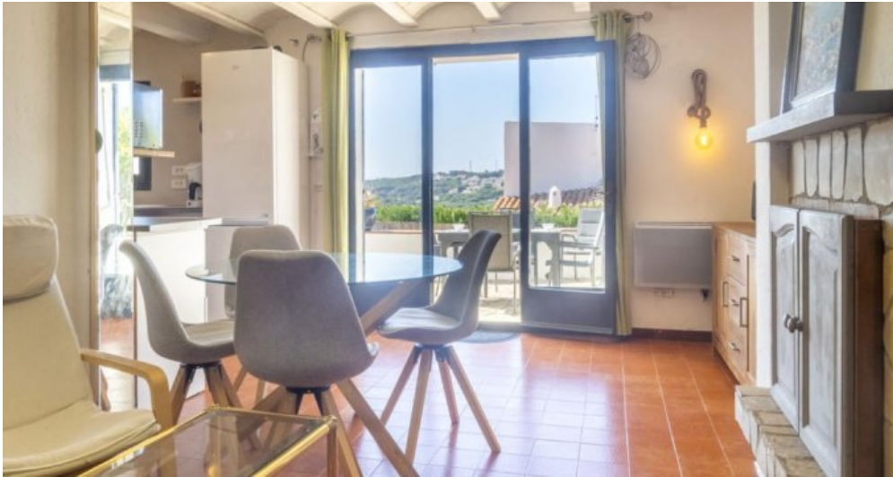
Ferienhaus Escala privater Pool