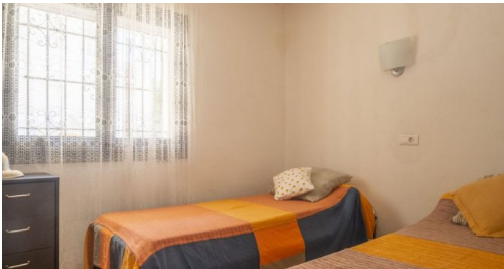
Ferienhaus Escala privater Pool