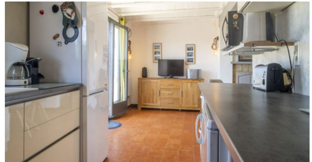
Ferienhaus Escala privater Pool