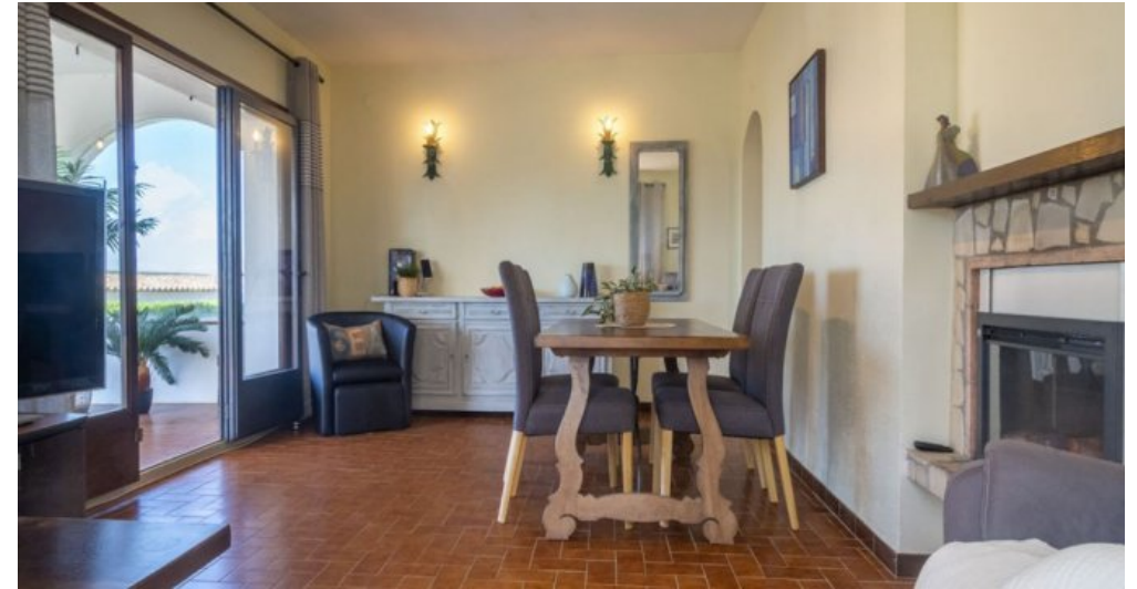
Ferienhaus Escala privater Pool