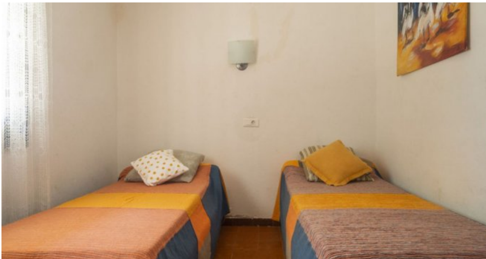
Ferienhaus Escala privater Pool