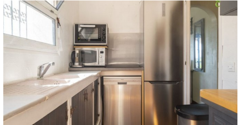
Ferienhaus Escala privater Pool