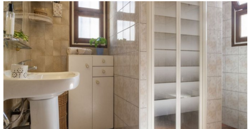
Ferienhaus Escala privater Pool