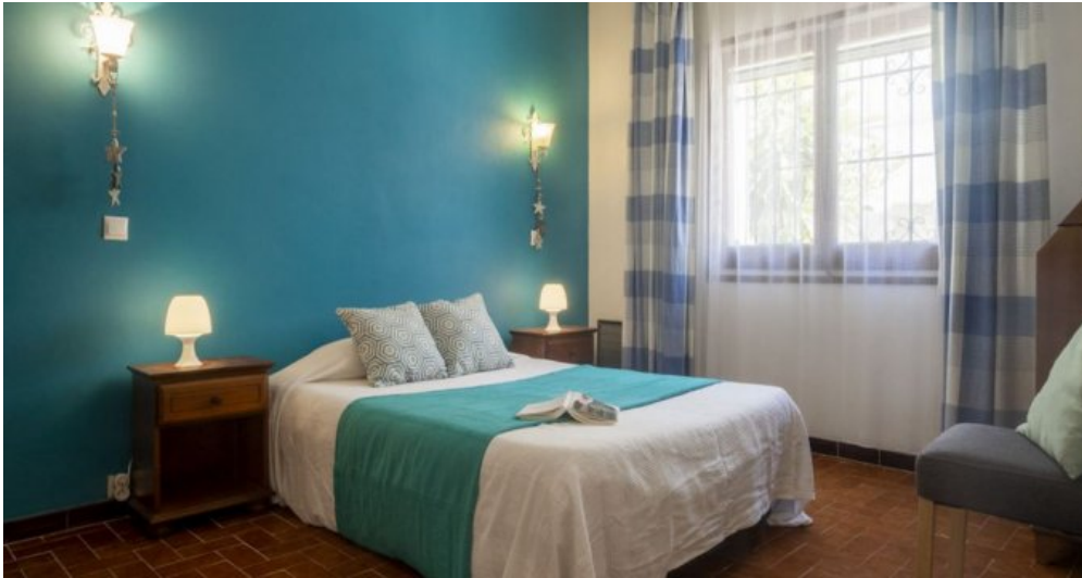
Ferienhaus Escala privater Pool