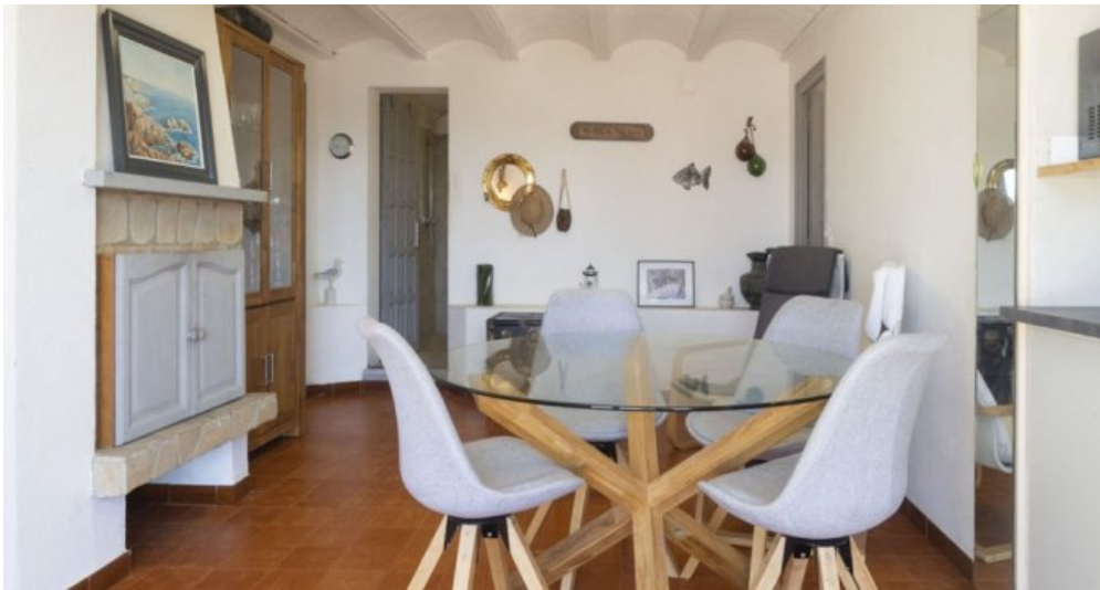
Ferienhaus Escala privater Pool