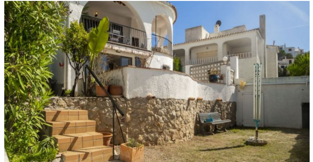
Ferienhaus Escala privater Pool