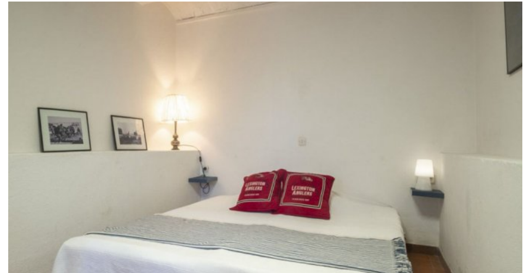
Ferienhaus Escala privater Pool