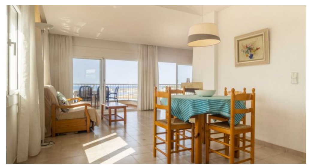
Spanien Strandferienwohnung l'Escala Costa Brava