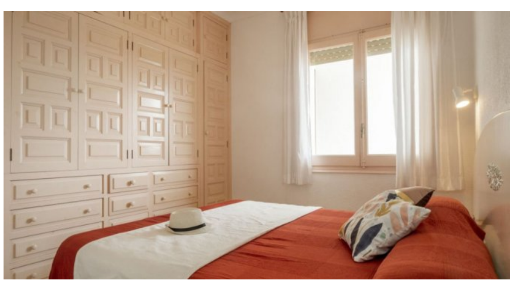
Spanien Strandferienwohnung l'Escala Costa Brava