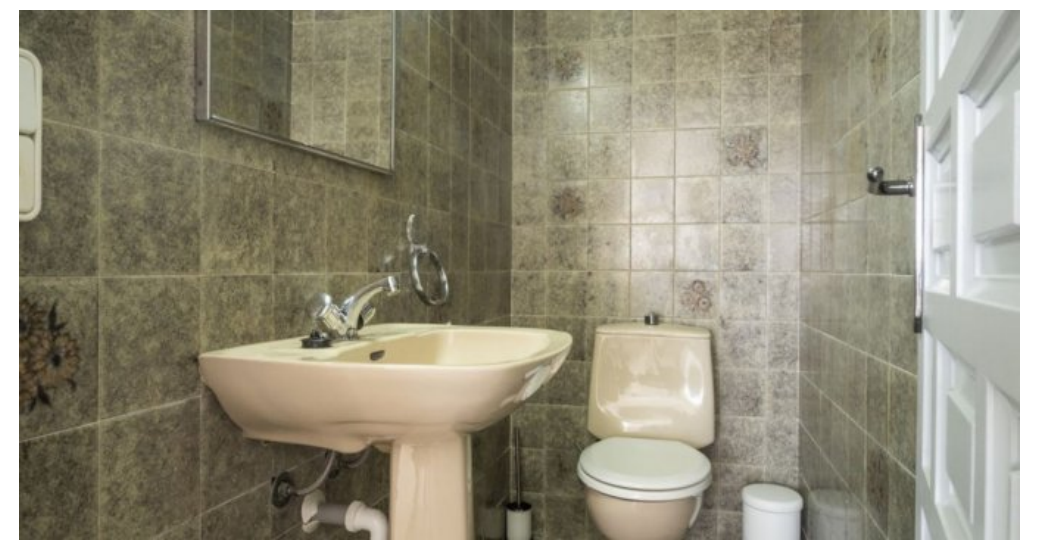
Spanien Strandferienwohnung l'Escala Costa Brava