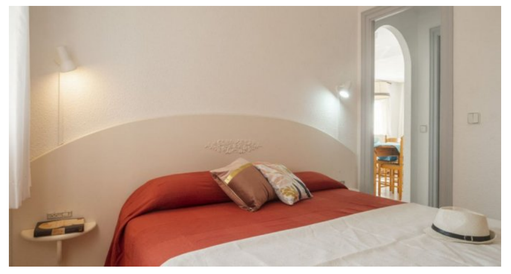
Spanien Strandferienwohnung l'Escala Costa Brava