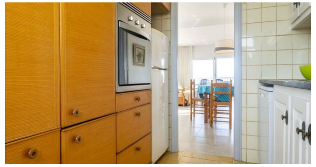
Spanien Strandferienwohnung l'Escala Costa Brava