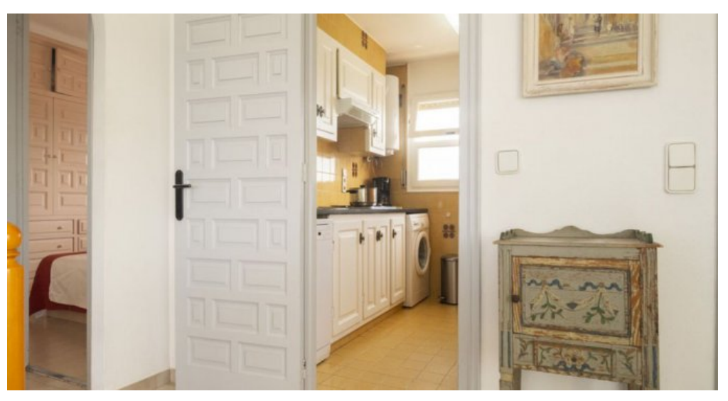
Spanien Strandferienwohnung l'Escala Costa Brava