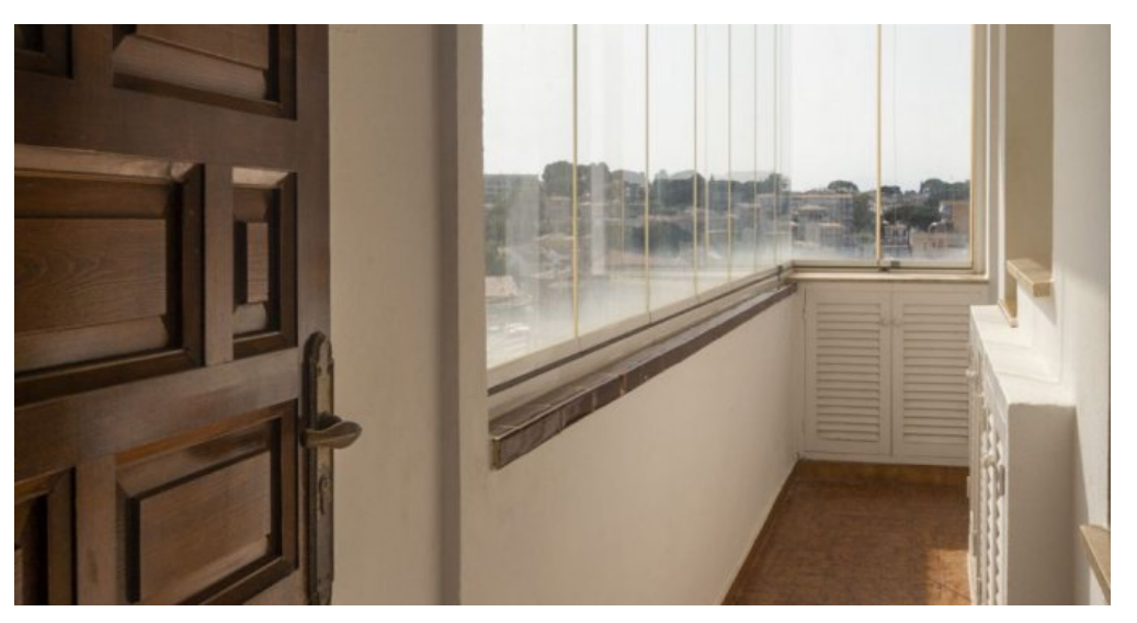
Spanien Strandferienwohnung l'Escala Costa Brava