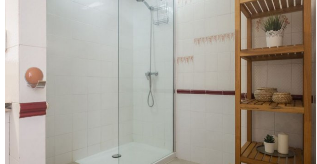
Spanien Strandferienwohnung l'Escala Costa Brava