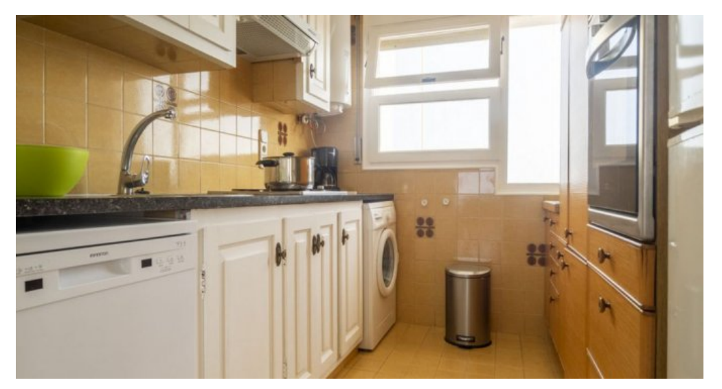
Spanien Strandferienwohnung l'Escala Costa Brava